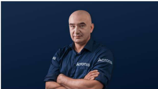
Serguei Belousov, Acronis CEO

Acronis, a data protection and storage company, achieved unicorn status on Wednesday with a $147 million funding round led by Goldman Sachs. The company's first major injection of cash boosts its valuation to more than $1 billion according to CEO and founder